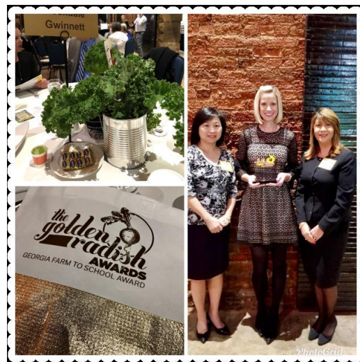
Gwinnett School Nutrition team members accepting the district's Golden Radish Award on behalf of the district.

This award evaluates school districts on their work in 10 different activities of farm to school. GCPS is one of 39 school districts across the state honored for its commitment to farm to school.